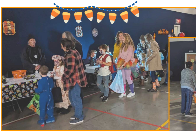
The Halloween Spooktacular was on October 31st.

Kids enjoyed treats, refreshments and a bounce house!