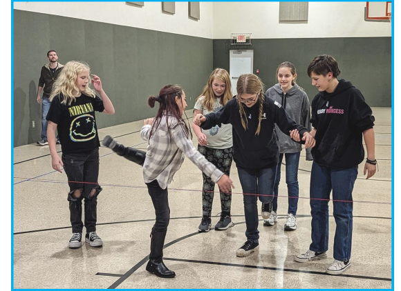
Christian Community Youth Rally at Mooreland First Christian Church on November 19th. (There will be no rally in December)