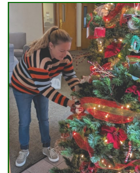
On November 26th a nice group stayed after worship to decorate the church.