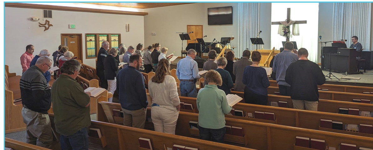
MSCC hosted the White River Valley Elder Retreat on April 20th.