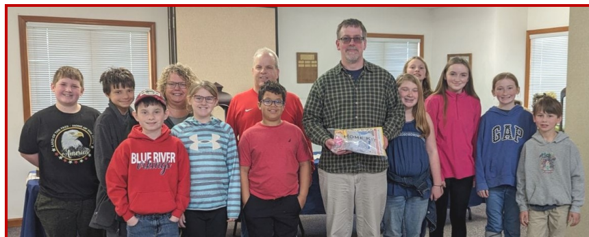
A LifeVac Choking Rescue Device was donated to MSCC from the Blue River Valley 4-H Club which meets here regularly.