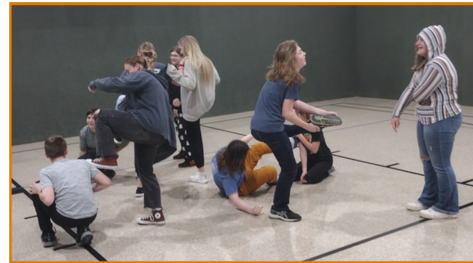
On April 21st area Youth participated in games at the Christian Community Youth Rally hosted at First Christian Church of Mooreland