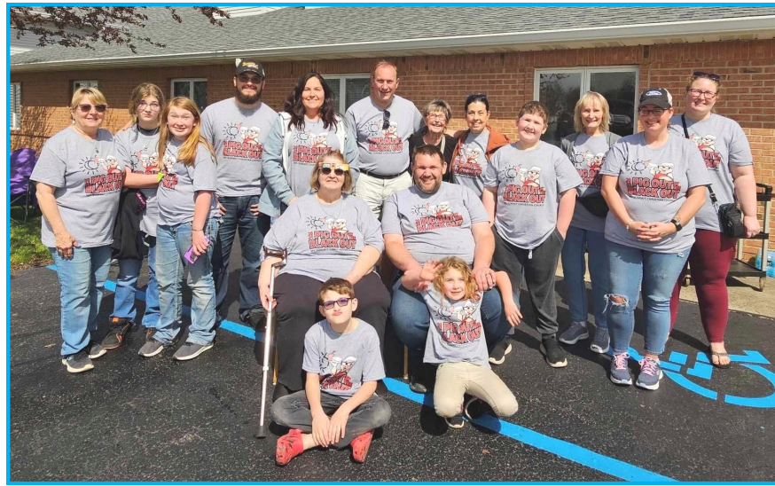
The group of volunteers for the "Pig Out at the Black Out" solar eclipse event on April 8th enjoyed hosting visitors and sharing the experience together.