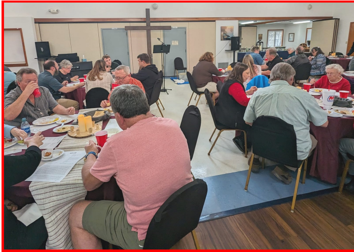
A Maundy Thursday dinner and service was held in the Fellowship Hall in conjunction with the congregation of First Christian Church of New Castle on March 28th.